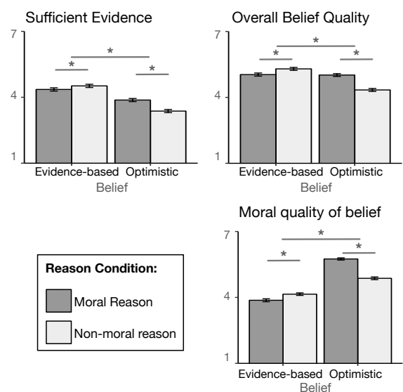
Figure 3. Study 2 means (and standard errors) for sufficient evidence, overall quality of belief, and moral quality of belief ratings. * p < .05 .

Prescribed motivated reasoning. Consistent with our predictions, the pattern of judgments for the belief's moral quality replicated for judgments of the overall quality of the belief (Figure 3B). When the two characters adopted the evidence-based belief, the character with the moral reason to be optimistic was seen as less justified and less permitted to hold the belief ( M = 5.04, SD = 1.62 ) compared to the other, more socially distant character ( M = 5.30, SD = 1.52 ), F(1,